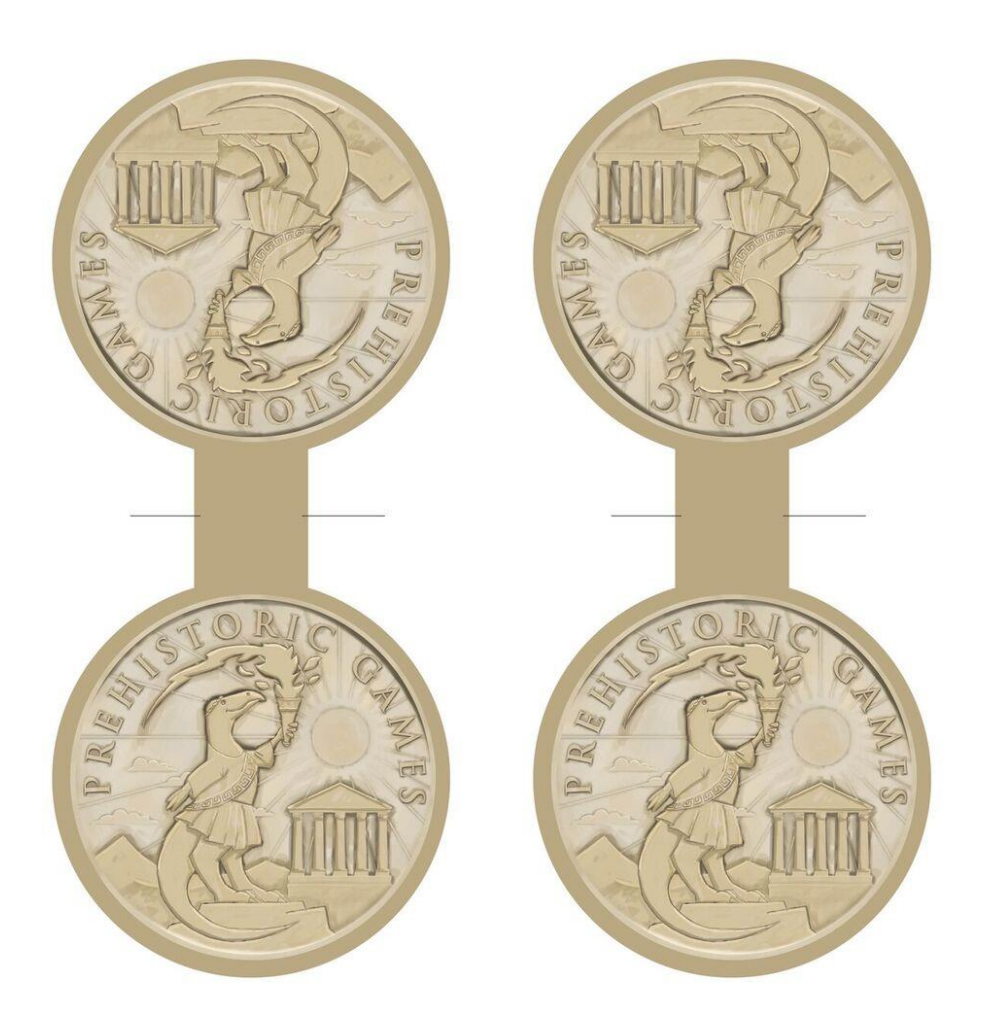
Illustration © Martin Davey

Print medals on card stock paper, cut out, fold over, and hole-punch. Use 24" thin hemp or twine lengths for a prehistoric-looking ribbon.